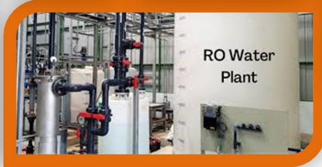
RO Water Plant