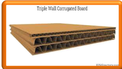
Triple Wall Corrugated Board